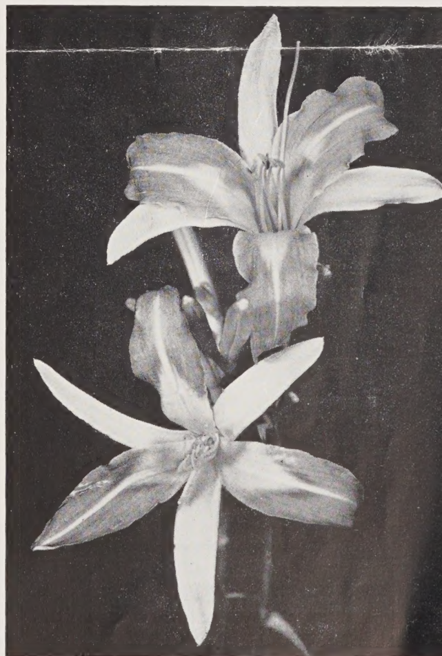
HEMEROCALLIS, GEORGE YELD

6 Plants One of each variety, value $11.25, for only . . . . . $9.25